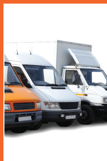
Van and Trucks