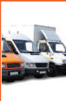
Van and Trucks